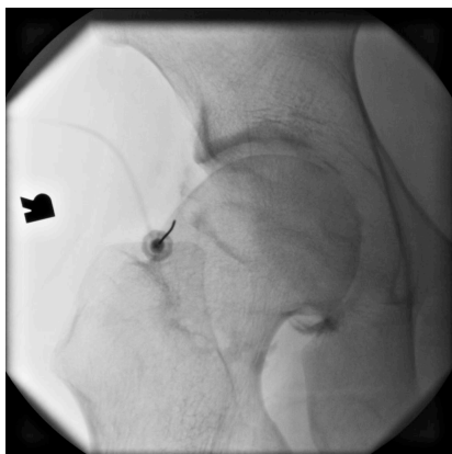
Fig 2: Intracapsular position confirmation,